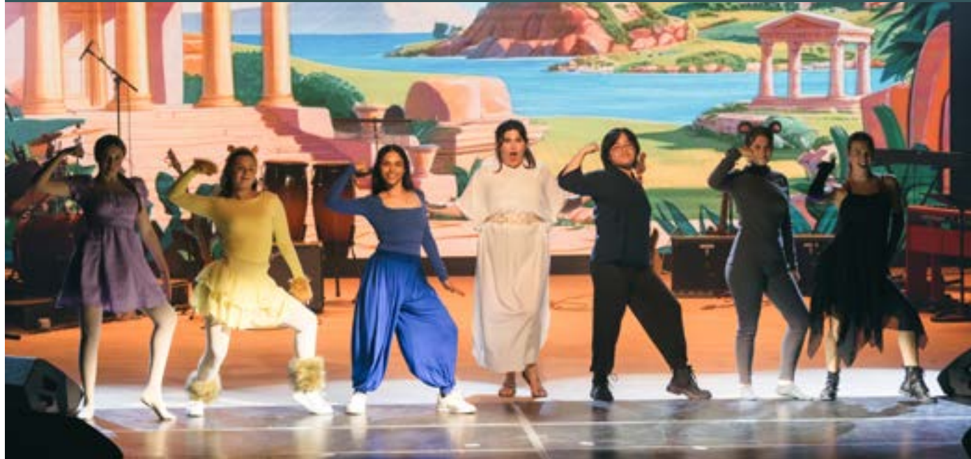
Musical in a Day: Italia Conti Returns